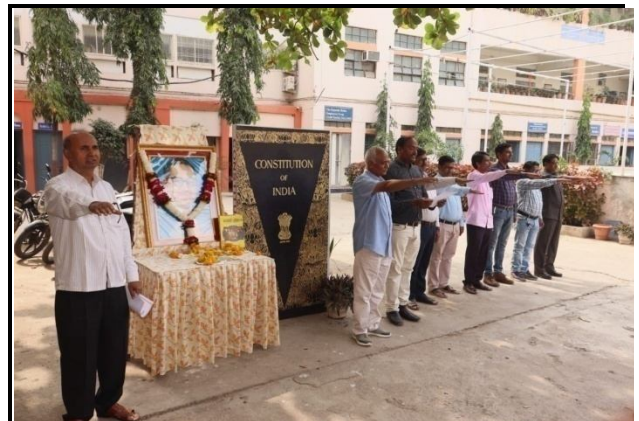
Students, teachers and non-teaching staff while taking oath of Indian Constitution