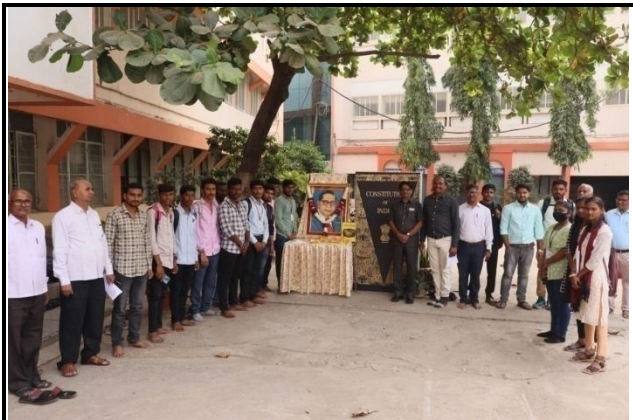
Students, Teaching and Nonteaching staff paying floral tributes to the image of the Dr. Babasaheb Ambedkar and Indian Constitution